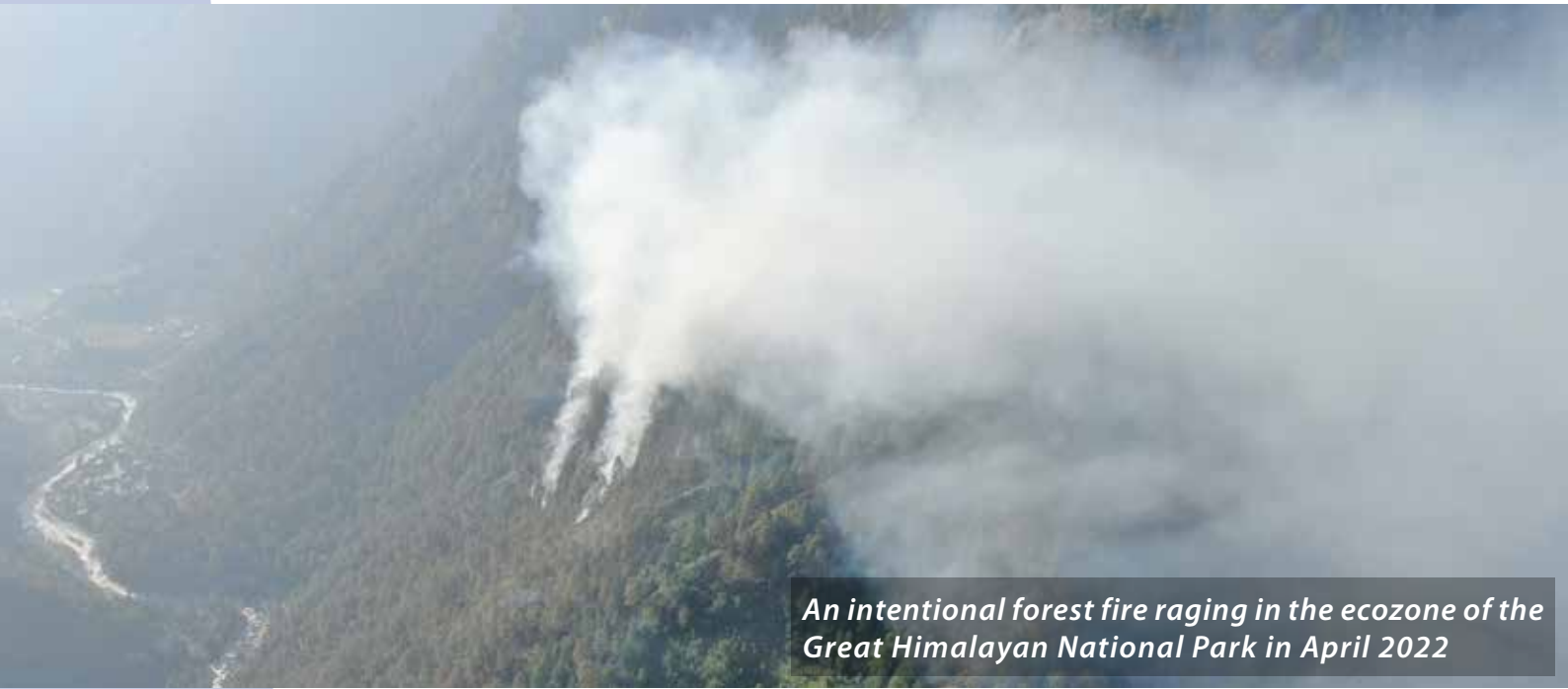
An intentional forest fire raging in the ecozone of the Great Himalayan National Park in April 2022

The prototypes were handed over to IIT Mandi for further R&D . We are looking for an entrepreneur to launch the production at a larger scale and find a way to introduce this practical and sustainable product to local communities here.