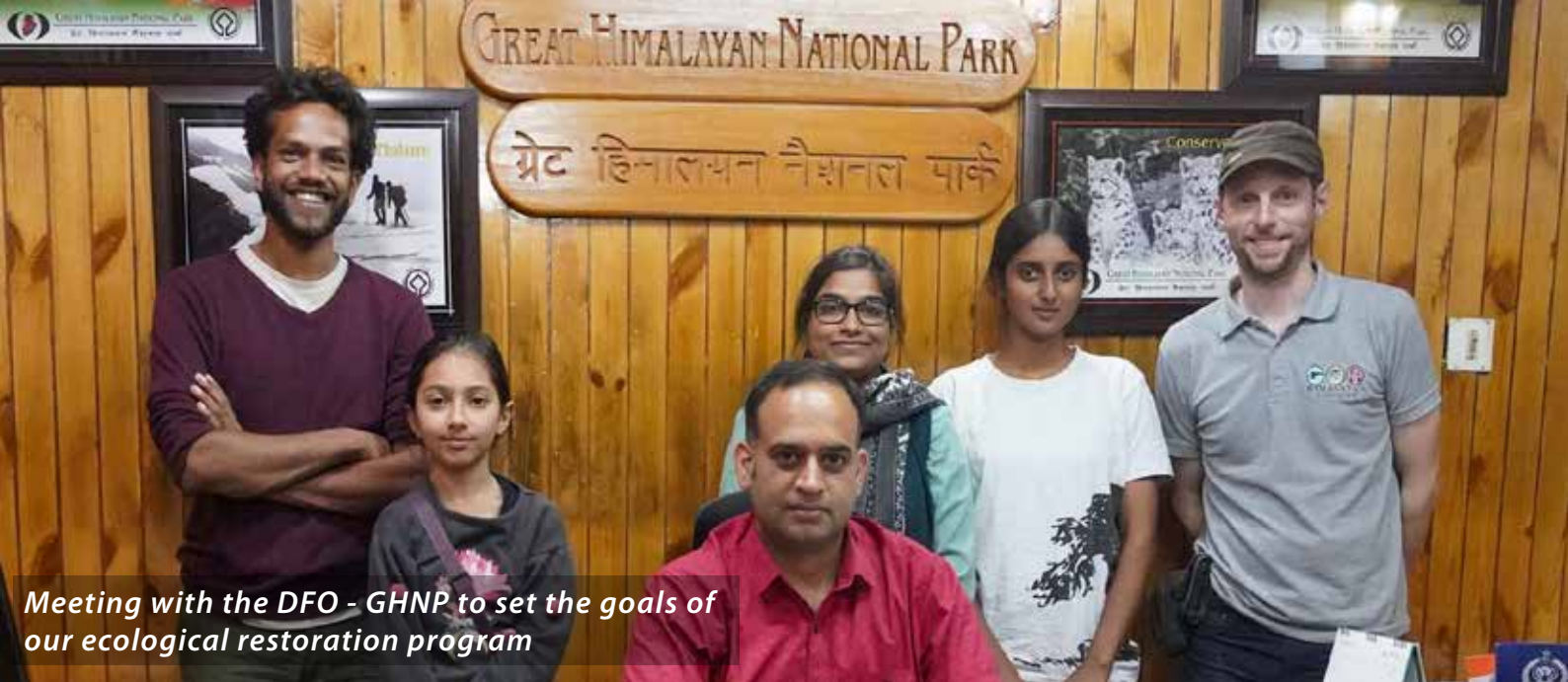
Meeting with the DFO - GHNP to set the goals of our ecological restoration program

We want to diversify the flora species we are caring for in the nursery by initiating a village-wide initiative of seed collection and growing of seeds into saplings for future reforestation drives. Monitoring the succession and progress of these habitats post-reforestation is crucial for future expansion plans in the area.