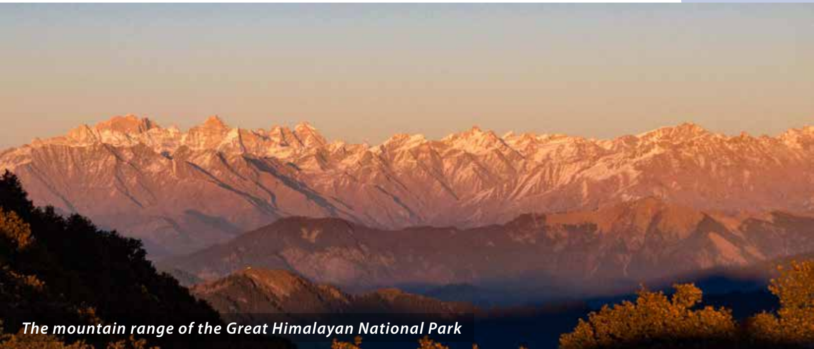
The mountain range of the Great Himalayan National Park

The Great Himalayan National Park (GHNP) , established in 1999, lies entirely in the Kullu district of Himachal Pradesh and spans over approximately 750 km 2 . Its southwest face, composed of the GHNP Ecozone, is home to approximately 2400 households that presently, rely on a range of livelihoods including agriculture, sale of Non-Timber Forest Produce (NTFPs) and more recently, tourism.