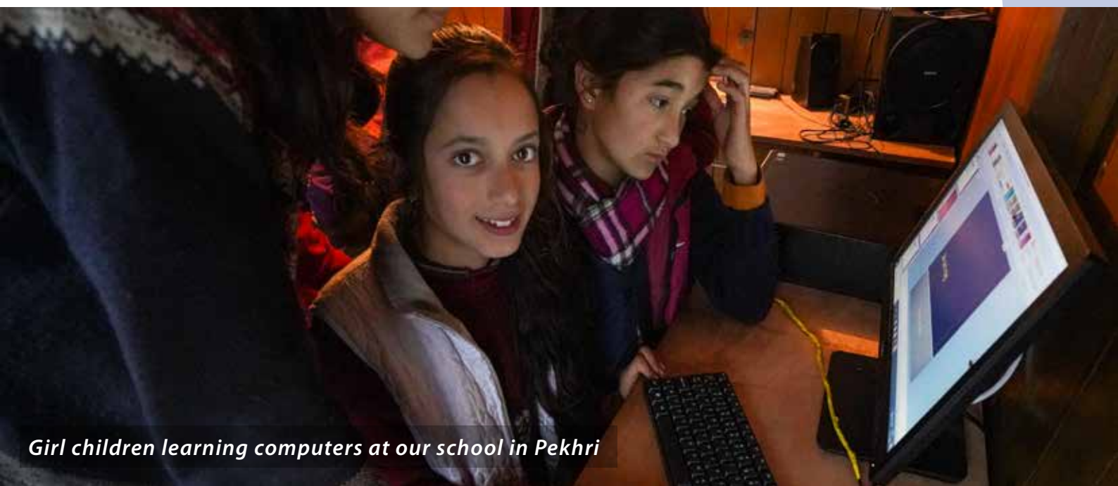
Girl children learning computers at our school in Pekhri

At the request of the local community, HET supported the creation and running of two schools in two villages, Bhiyar and Pekhri during the pandemic. Through our internship program, we have also had experienced individuals come on board to enhance the teaching methods employed at their schools to expose children to important concepts like climate change and the harmful effects of intentional forest fires. We screened documentaries and ran a range of exciting activities to stimulate them and nudge them towards understanding their environment in a better way.