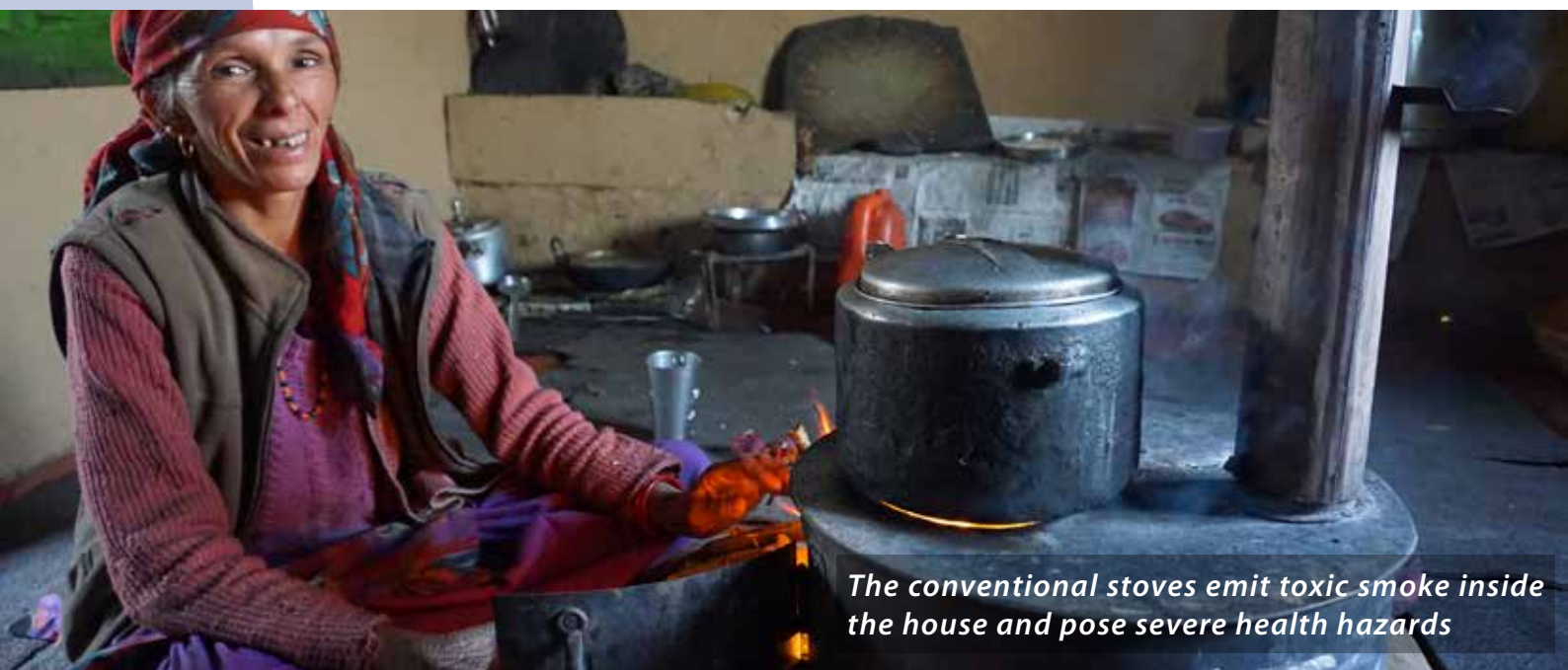
The conventional stoves emit toxic smoke inside the house and pose severe health hazards