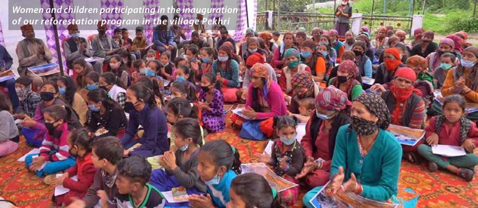
Women and children participating in the inauguration of our reforestation program in the village Pekhri

production. Through crowdfunding, HET was able to keep women and cooperative members employed through our reforestation program which involved running the nursery and caring for saplings. We intend on keeping the micro-enterprise branch of the women empowerment program under the umbrella of HET while shifting the children's education program and reforestation work under the umbrella of Himalayan Insight and our further plans are discussed in the next section of the report.