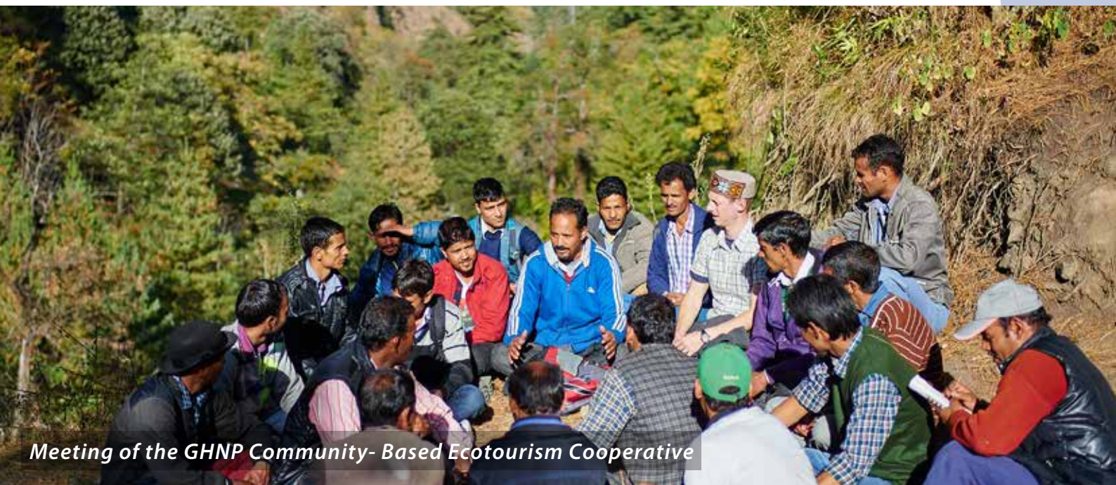
Meeting of the GHNP Community- Based Ecotourism Cooperative

While tourism has offered some an alternate livelihood, it has detrimental effects on the surrounding natural ecosystems through intense resource use. Himalayan Ecotourism (HET) nurtures a collaboration with the local communities of the Ecozone to support economic development of the local people through ethical business to reduce pressures of resource use on the National Park, while diverting profits to social and ecological initiatives such as children's education, women empowerment, reforestation and forest fire prevention.