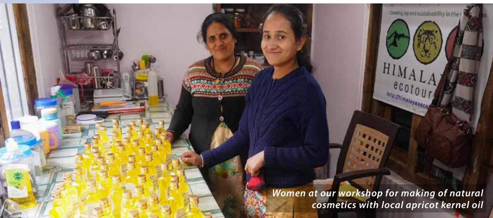
Women at our workshop for making of natural cosmetics with local apricot kernel oil

In the continuity of our past efforts, we want to provide the marginalized women of Tirthan Valley with education and the creative skills training needed to become professional and talented designers, seamstresses, embroiderers, weavers, and jewelry designers of the handcraft industry. Through our program, more women would gain the creative skills and financial independence by creating sustainable fashion that is life affirming and supports a healthy environment.