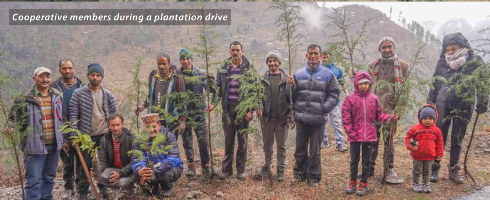
Cooperative members during a plantation drive

The 5 sqkm project area of ecological restoration for which a microplan has been devised