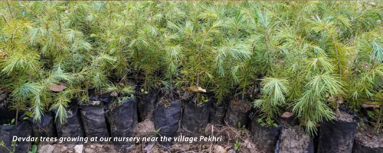
Devdar trees growing at our nursery near the village Pekhri