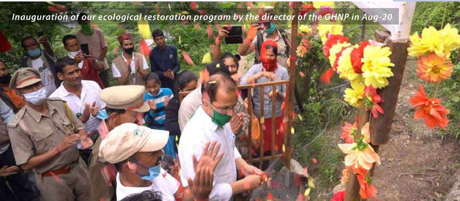
Inauguration of our ecological restoration program by the director of the GHNP in Aug-20

experience economic development and employment generation. Culturally, modernized and fast-paced development in the valley has led communities here to a state of disequilibrium in the form of loss of a collective culture and a detachment from traditional roots and practices.